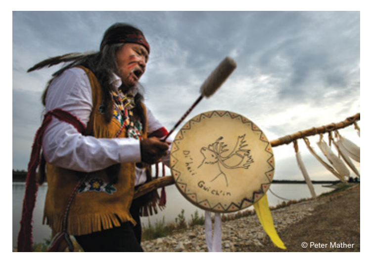
Oil drilling in the Arctic National Wildlife Refuge would severely threaten the Gwich'in way of life.

Refuge are wildly exaggerated. Their skepticism is grounded in current and projected low oil prices, the Refuge's remote locale and daunting winter weather, and the hundreds of oil leases still up for grabs elsewhere in Alaska and the lower 48, which can be operated at much cheaper prices.