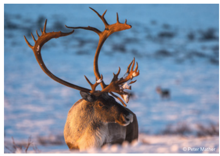
The Gwich'in have been sustained for millennia by the Porcupine Caribou Herd, whose calving grounds are precisely where Trump wants to see drilling rigs.

At stake is the preservation of a national heritage that has been called America's Serengeti, where polar bear, musk ox and other threatened wildlife and plant species flourish. This spectacular