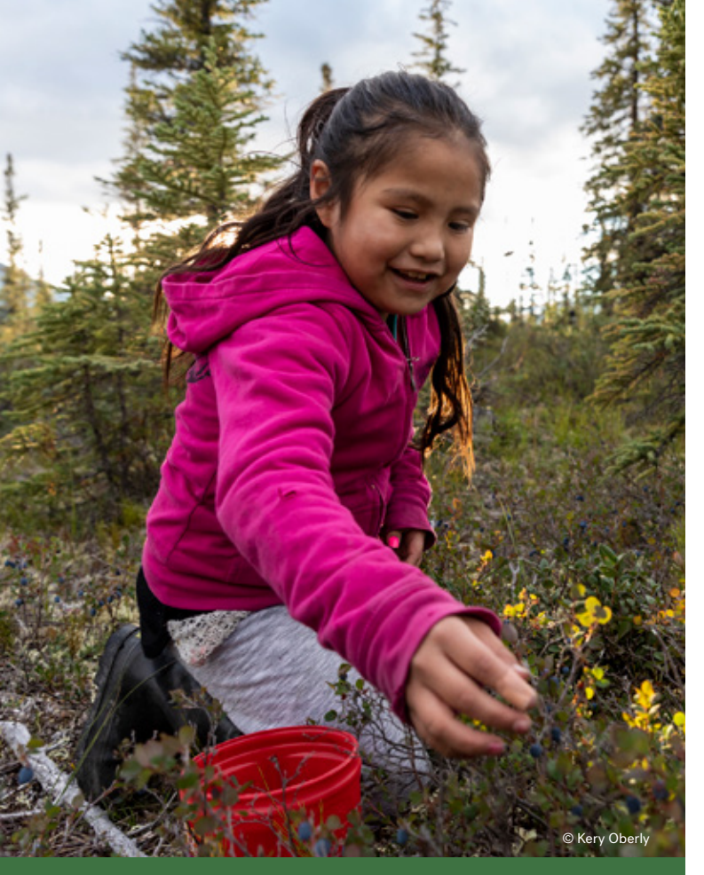
For the Gwich'in people, the Arctic Refuge sustains their livelihood.

Oil companies and their friends in Congress have tried for decades to drill in the coastal plain, defiling it with roads, airstrips, heavy machinery, noise and pollution. In 2017, the Republican majority in Congress forced opening the coastal plain to oil development into a major tax bill that narrowly passed along partisan lines—effectively shattering 40 years of bipartisan agreement to protect it.