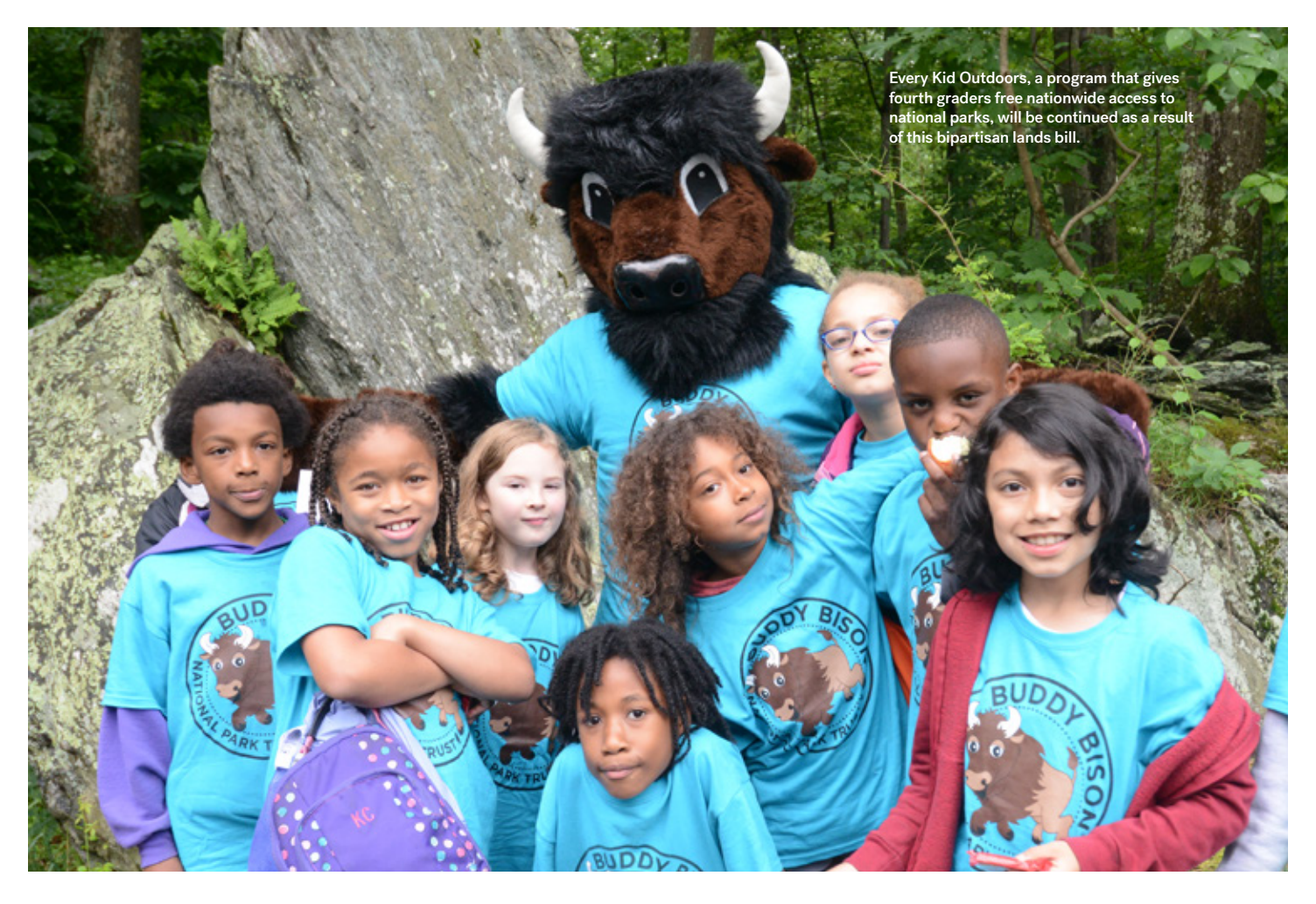
CELEBRATE THE MOST SIGNIFICANT PUBLIC LANDS BILL IN A DECADE continued from page 1

Medgar and Myrlie Evers in Mississippi and a Civil Warera training facility for the Union's African American soldiers in Kentucky, it makes progress in recognizing the full story of America. Finally, it extends the Every Kid