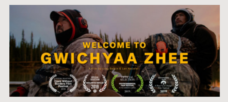
Visit www.wilderness.org/gwichyaa-zhee to view the film and find out how you can stand with the Gwich'in to protect the Arctic Refuge.

The Wilderness Society proudly presents <u>Welcome to</u> <u>Gwichyaa Zhee</u>, a short film that features an intimate look at the Gwich'in community of Fort Yukon, Alaska and their quest to protect their home.