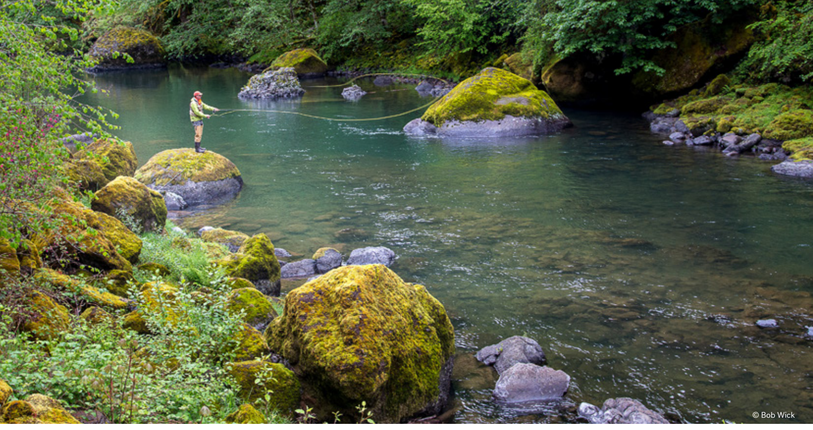
The most significant public lands bill in a decade was signed into law in March protecting 2.3 million acres nationwide, including the expansion of the Molalla River Wild and Scenic designation in Oregon.

MEMBER NEWSLETTER • SUMMER 2019 • VOL. XXI, NO. 3 • WWW.WILDERNESS.ORG