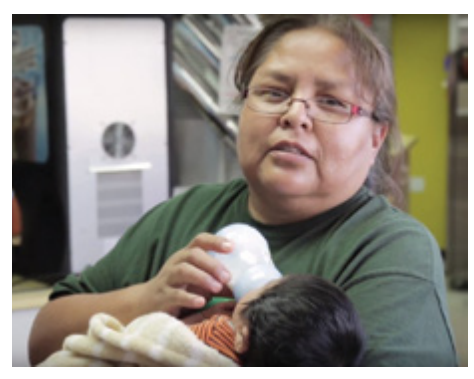
BEARS EARS NATIONAL MONUMENT

"It's holy, it's holy. Even just the sight of it, that's home. You feel at home."