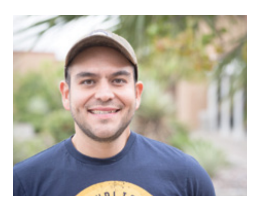
ORGAN MOUNTAINS – DESERT PEAKS NATIONAL MONUMENT

"It's important to me as a Hispanic person living here that that history is documented too. The story told here in this national monument is Hispanic history, is indigenous history."